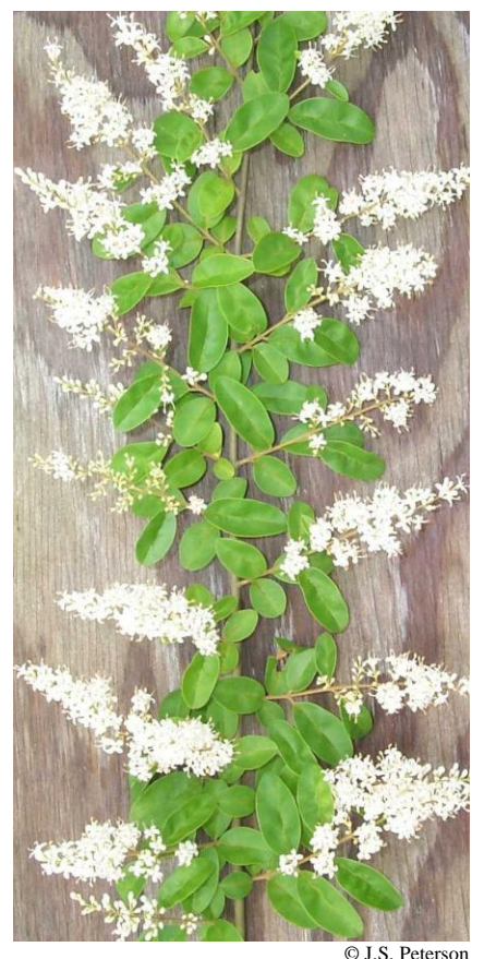
USDA, NRCS, NPDC

Contributed by: USDA NRCS National Plant Data Center & Louisiana State University-Plant Science; partial funding from the US Geological Survey and the US National Biological Information Infrastructure