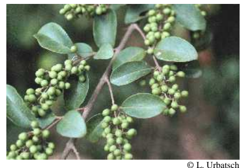
Leaves with developing fruit.

Chinese privet grows in a wide variety of habitats and can tolerate a wide range of soil and light conditions, but it grows best in mesic soils and abundant sunlight but can tolerate lower light conditions (Thomas 1980; Bailey & Bailey 1976). Few woody plants offer an easier test of gardeners' skills.